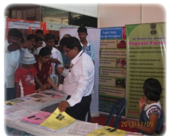
PGS promotion during International farmer fair at UAS Bangalore, Karnataka

PGS India is based on the principles of participation, transparency and trust. Through the program, PGS initiatives may obtain national recognition and support for building their institutional structure without affecting the PGS spirit. The PGS India