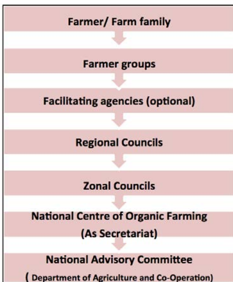
The organizational structure of PGS India

The Indian Government initiated its PGS India program in 2010; officially, the program was launched in March 2011. PGS India is a well-knit institutional network that provides a common platform to PGS groups across the country to share experience for better implementation of PGS and Organic Agriculture. To ensure consistent quality and to strengthen consumer trust, residue testing is carried out randomly. For transparency, PGS India has made its entire database available to consumers online. The government supports PGS India by bearing the cost of institutional networking, surveillance and monitoring as well as data management, turning organic certification through PGS into a low cost intervention for organic farmers.