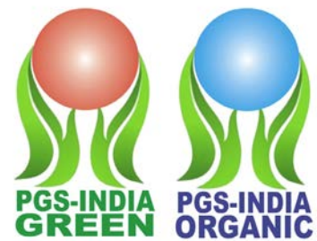
Logos used in PGS India certificates

For the local market, and for the promotion of the organic movement, PGS has been initiated and become popular as a locally focused alternative method for organic quality assurance. At the moment, two parallel PGS systems have been established in the country: The PGS Organic Council (PGSOC), operated by civil society organizations, i.e. the Integrated Institute of Rural Development, OFAI, Keystone Foundation etc. and PGS India, which is led by the Government of India.