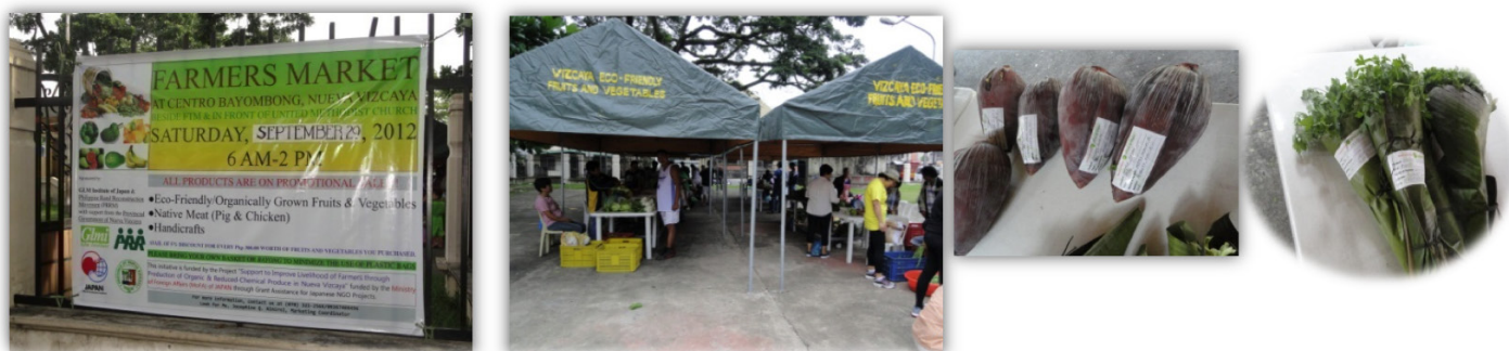
Farmers Market at Centro, Bayombong, Nueva Vizcaya