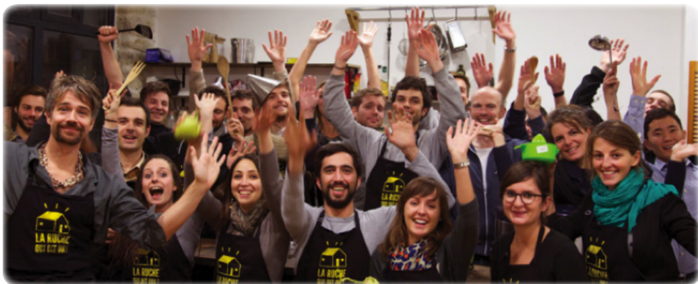
The staff of “La ruche qui dit oui” start-up company.

“Short market channels 2.0” will look like: digital, local and participatory.